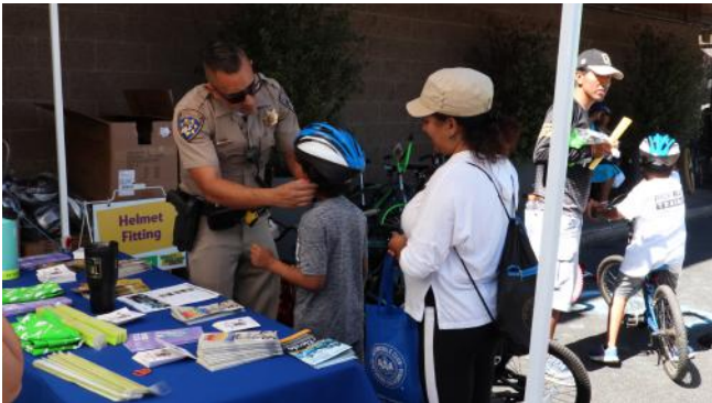
CHP officer fits child with helmet at 'Go Human' event in Culver City Sept. 15. Children were also taught lessons on bicycle safety, like looking for traffic and navigating intersections.

The OTS attended the "Experience Elenda" Open Streets event in Culver City Sept. 15. It was one of many community events organized by SCAG that allow residents to test out street improvements, such as protected bike lanes and high-visibility crosswalks that make roadways more bicycle and pedestrian friendly.